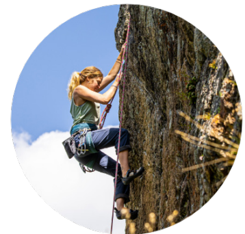
Sports & Leisure