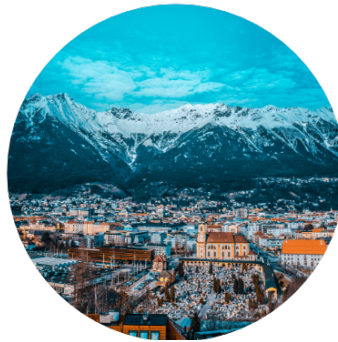
Alpine life quality