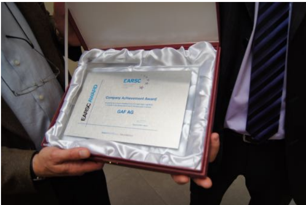
2015 Achievement Award Plaque